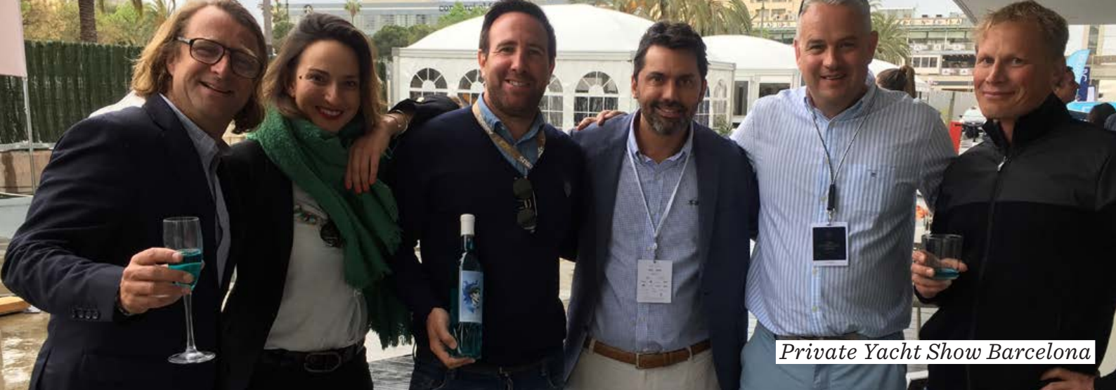
Private Yacht Show Barcelona