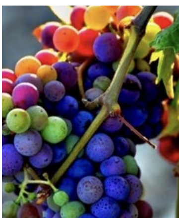
grapes rinsed with sea water

The magic of nature happened right from the first attempt to make this wine of the sea as it turned out to be blue when no one had predicted this small miracle. What could have been a better tribute to Corsica, the sea, and the desire to stand out that the Milanini Brothers had inherited from their father than an azure blue-coloured wine?