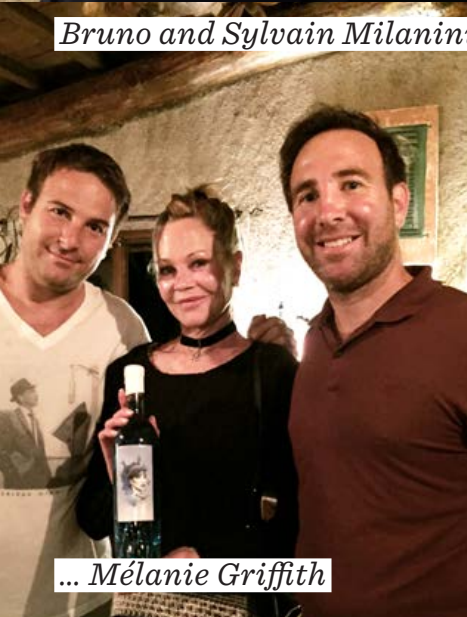
... Mélanie Griffith