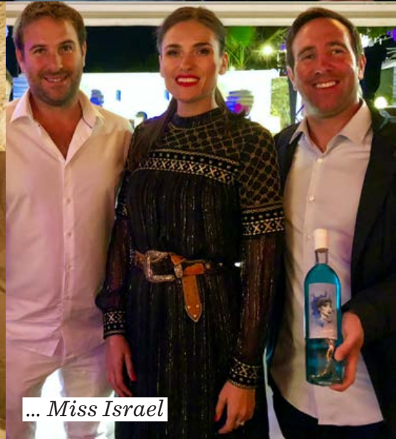
... Miss Israel